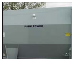
Fire Hose Ports