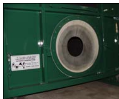
NEW - Bin Hole Reducing Diaphragm*