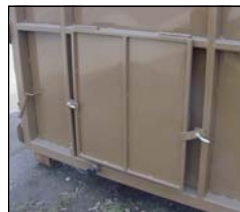
Bin Liquid Drain