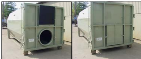
Hinged Metal Auger Hole Cover